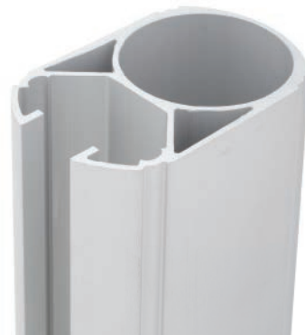
EXTRUDED ALUMINUM MAST