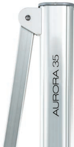
EXTRUDED ALUMINUM ON ALL CRITICAL JOINTS