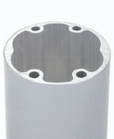
EXTRUDED ALUMINUM MAST