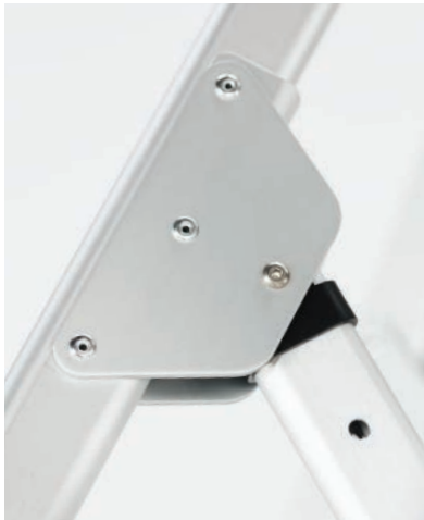
DOUBLE REINFORCED JOINTS