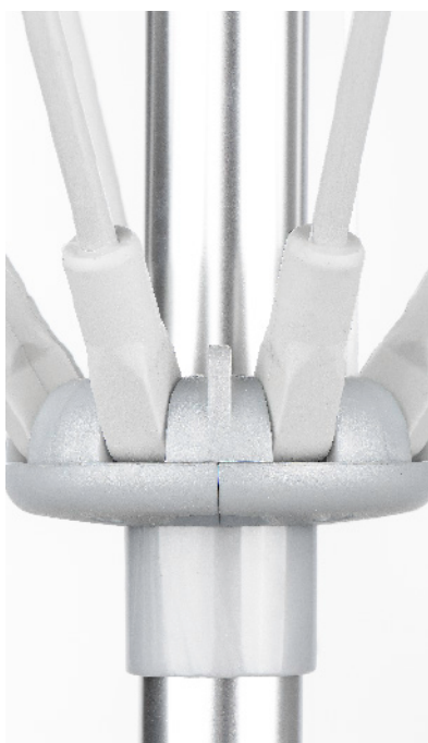
1.5" DIAMETER CENTER POLE

We use a stainless steel grommet at the top of the notch to keep the fabric in place and prevent rust stains. This exceptional umbrella will perfectly complement any outdoor setting!