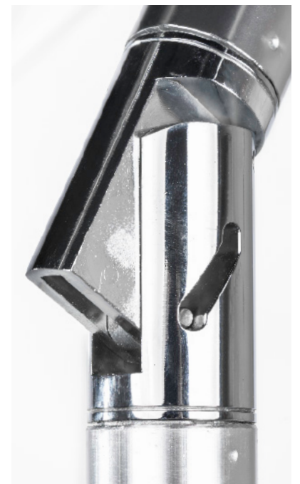
COMMERCIAL AUTO TILT