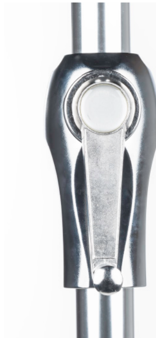
COMMERCIAL CRANK SYSTEM